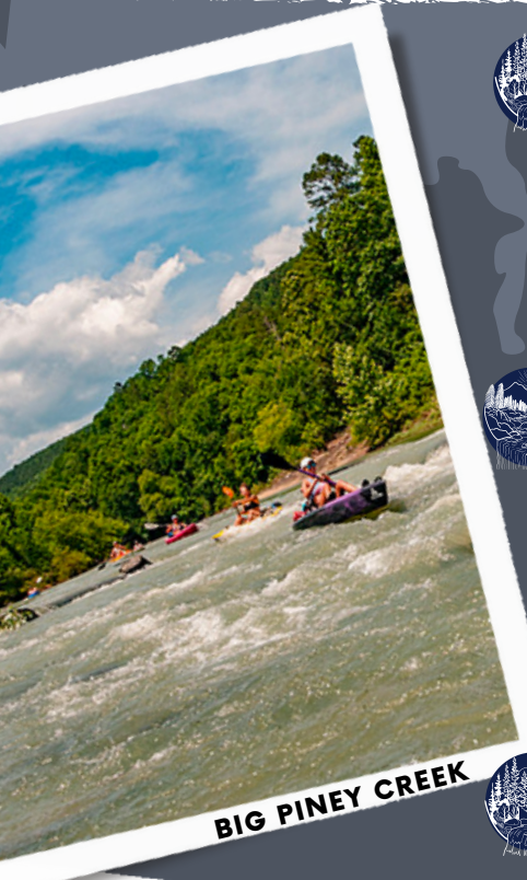
BIG PINEY CREEK